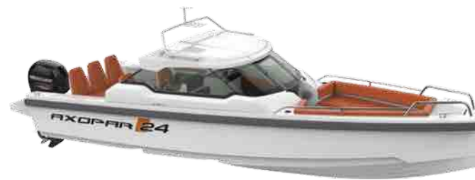
Axopar 24 HT