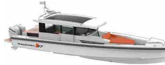
Axopar 37 AC