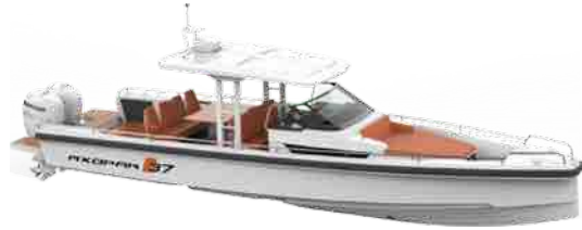
Axopar 37 T-Top