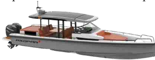
Axopar 37 Version R