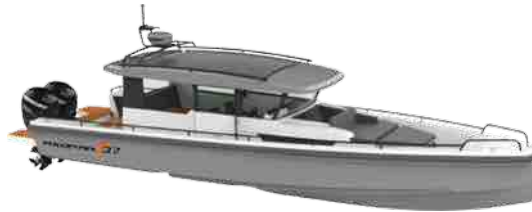
Axopar 37 Version R