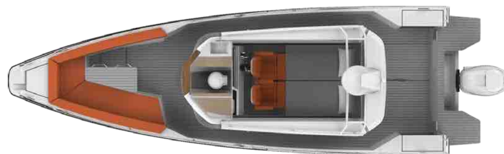
open aft deck (standard)

This highly adaptable model has ample space for fishing and other activities on the aft deck and a large social area on the foredeck that can be quickly and easily converted into a sun bed or a seating and table area. The foredeck also incorporates a stowage space with optional toilet in front of the helm. Whether for cruising, fishing or just unwinding with friends and family you'll love the Axopar 28 Cabin.