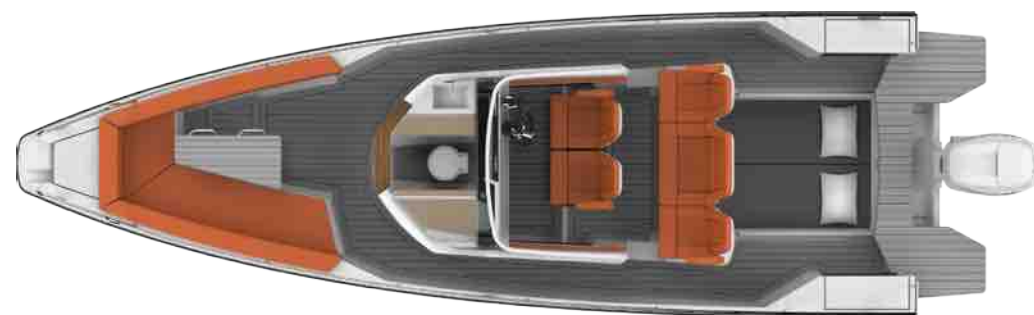
aft cabin (standard)

Get ready for the red carpet with this "Monaco Chic" cruiser.