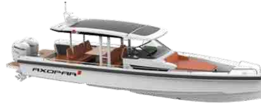
Axopar 37 Sun-Top