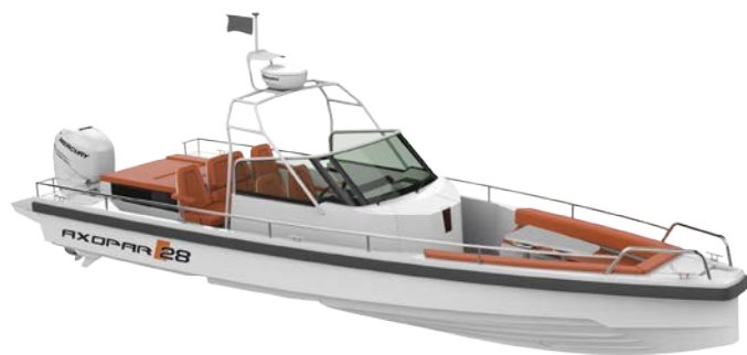
Axopar 28 Open/OC