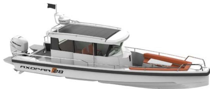
Axopar 28 Cabin