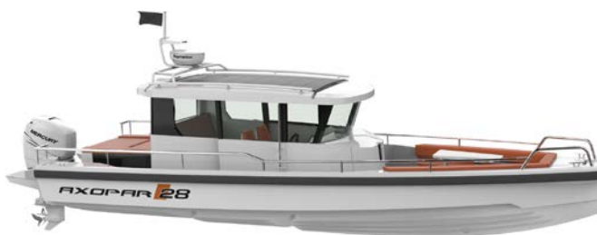
Axopar 28 AC