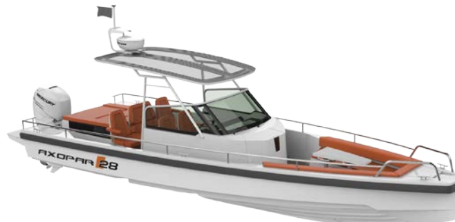
Axopar 28 T-Top