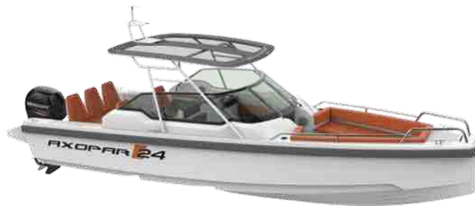
Axopar 24 T-Top