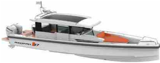
Axopar 37 Cabin