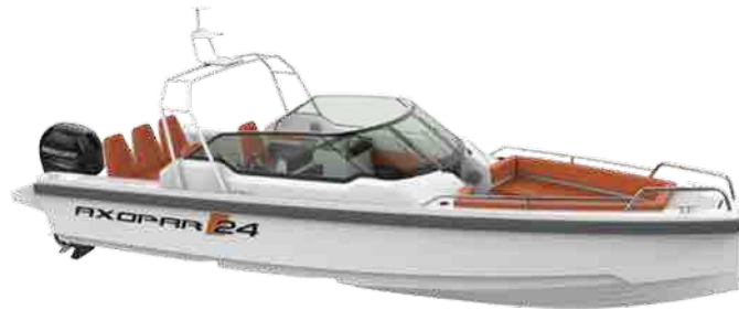
Axopar 24 Open